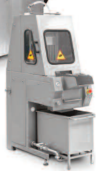
MHH-21 Brine Injector