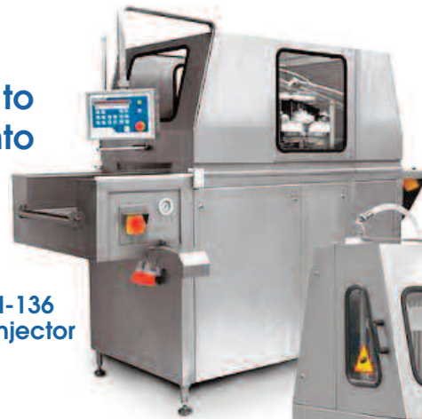
MHH-136 Brine Injector