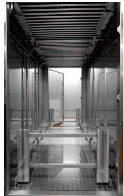
Inside Smokehouse with Ramps Up

Corporate Office 2899 Dowd Drive Santa Rosa, CA 95407 707-523-5940